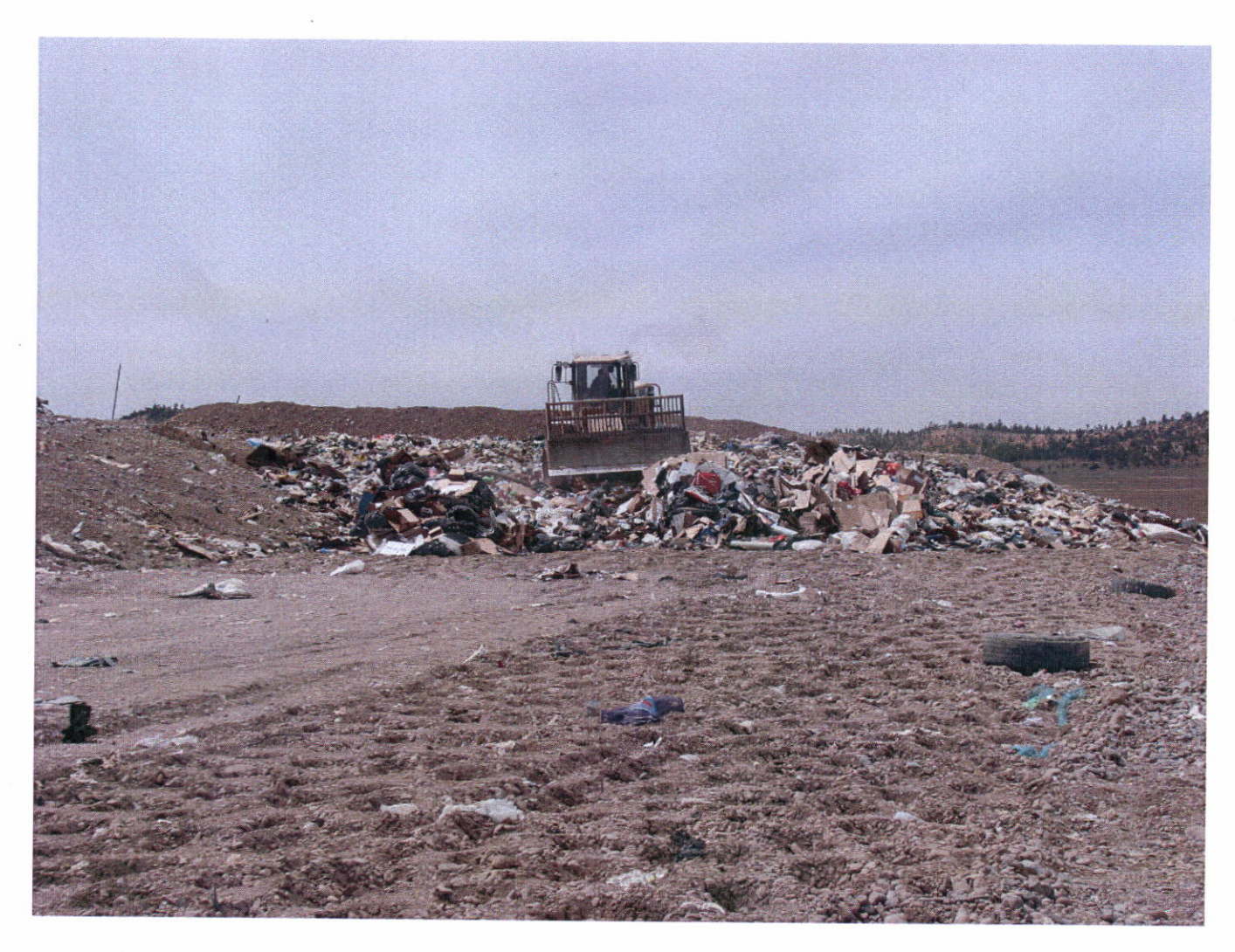
Looking west at the working face