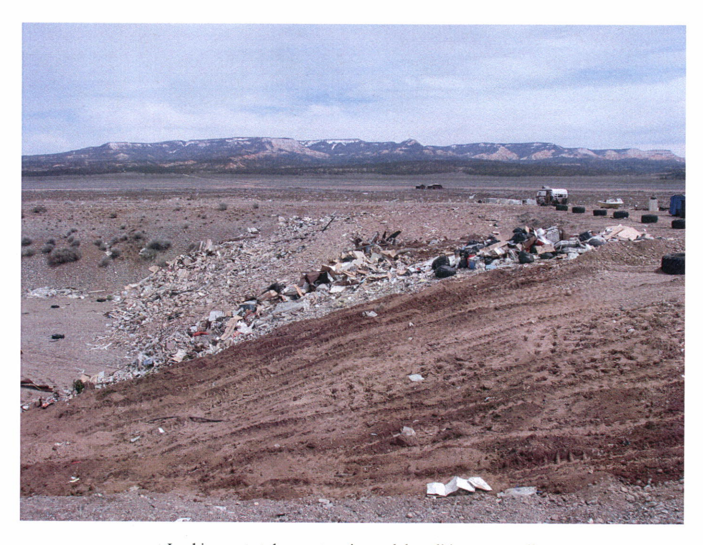
Looking east at the construction and demolition waste cell