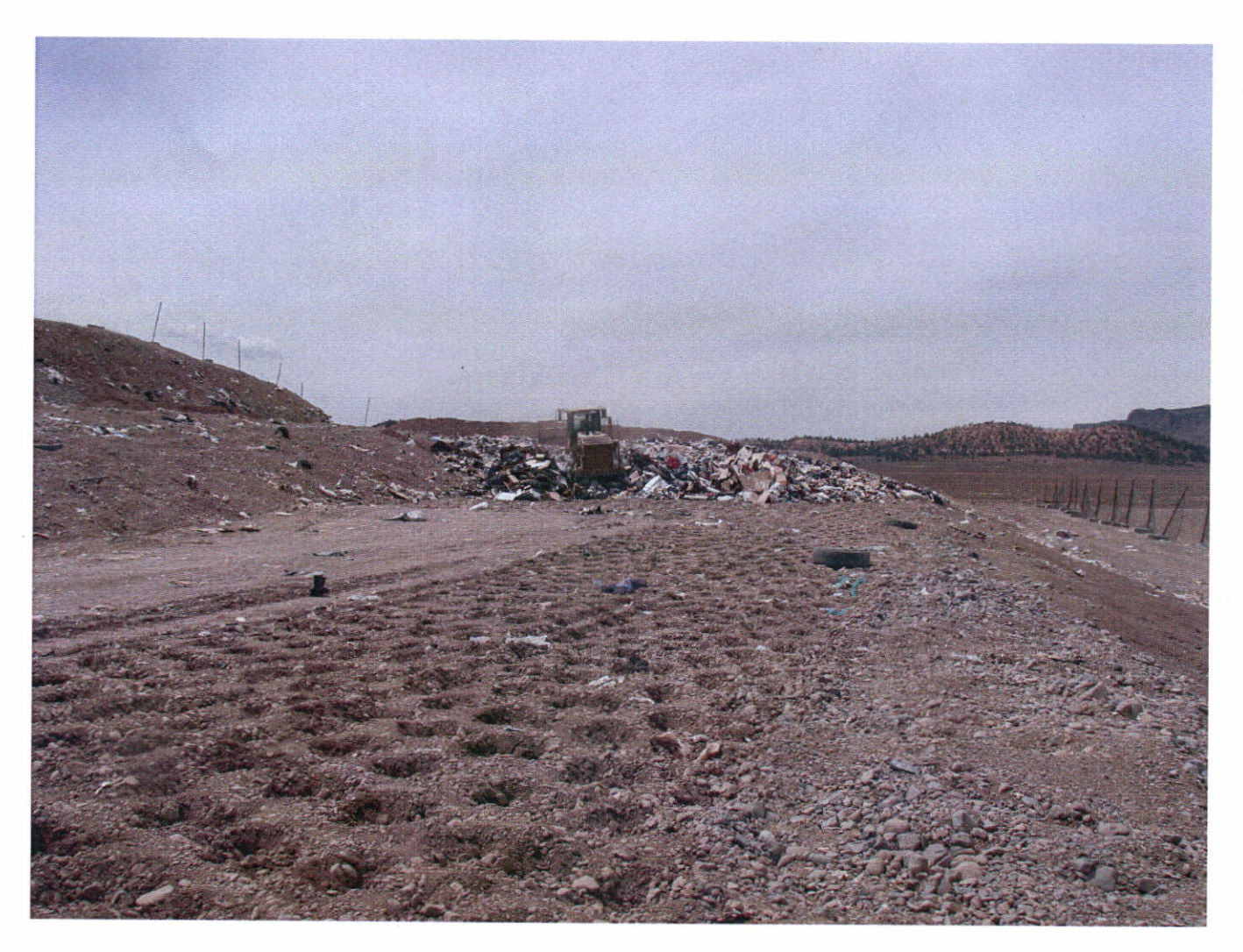
Looking west at the compactor working the face