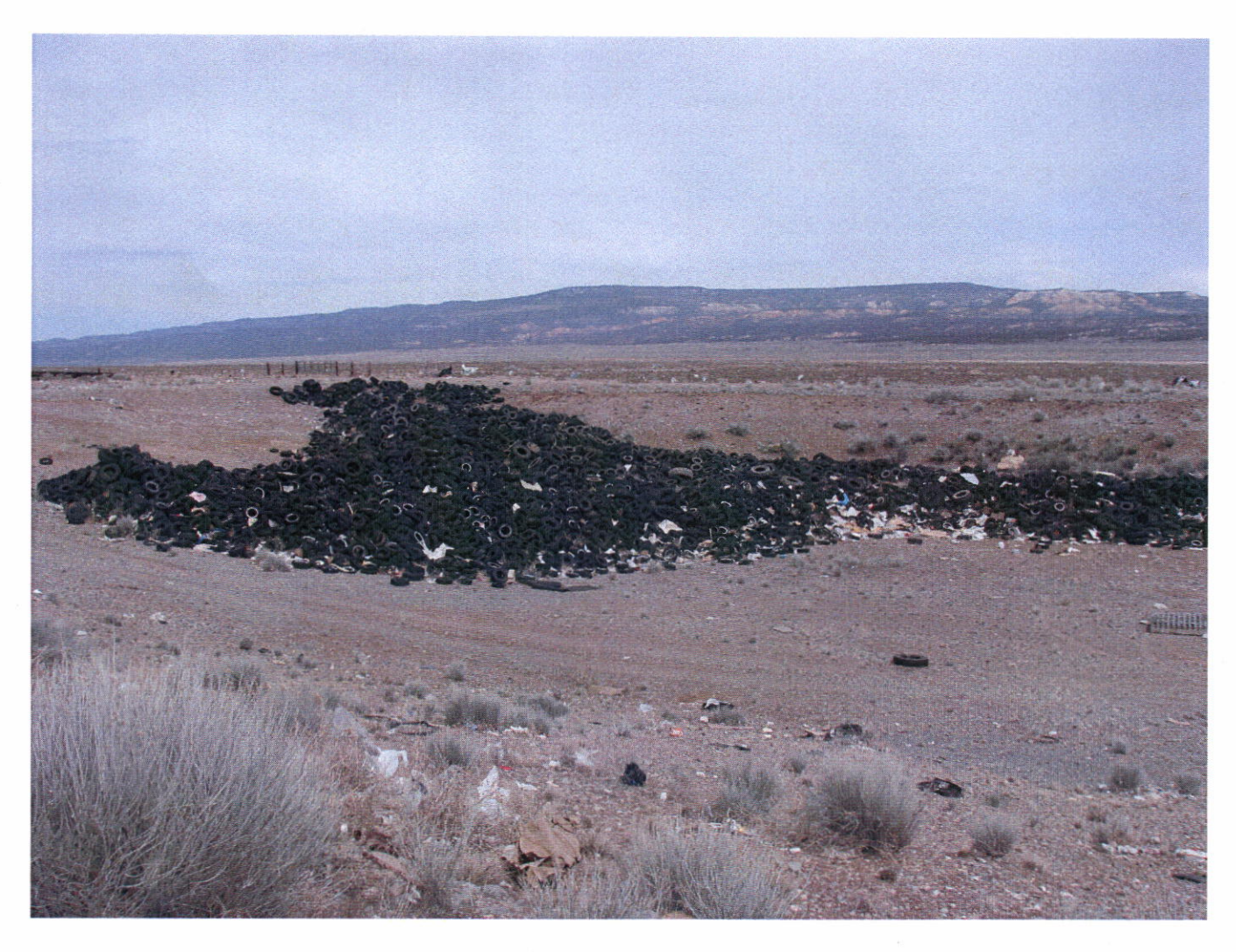
Waste tire pile number 2